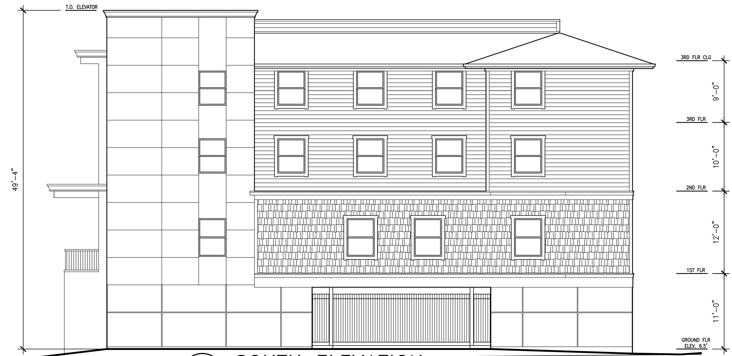
2 SOUTH ELEVATION A3.0 SCALE: 1/8" = 1'-0"