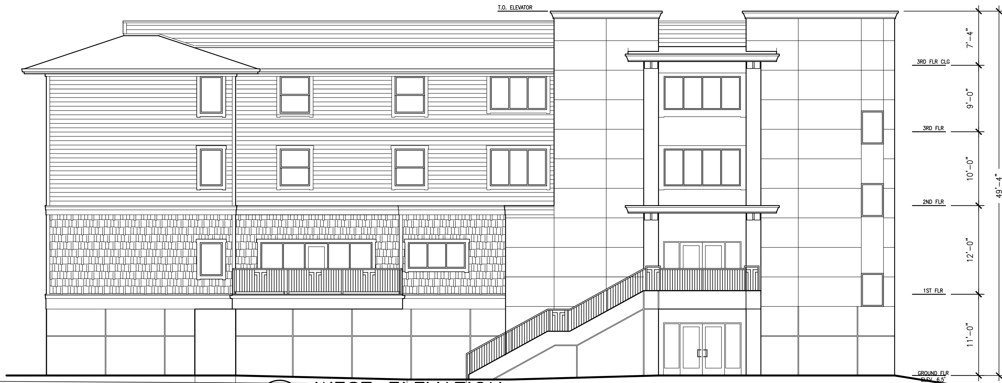
1 WEST ELEVATION A3.0 SCALE: 1/8" = 1'-0"