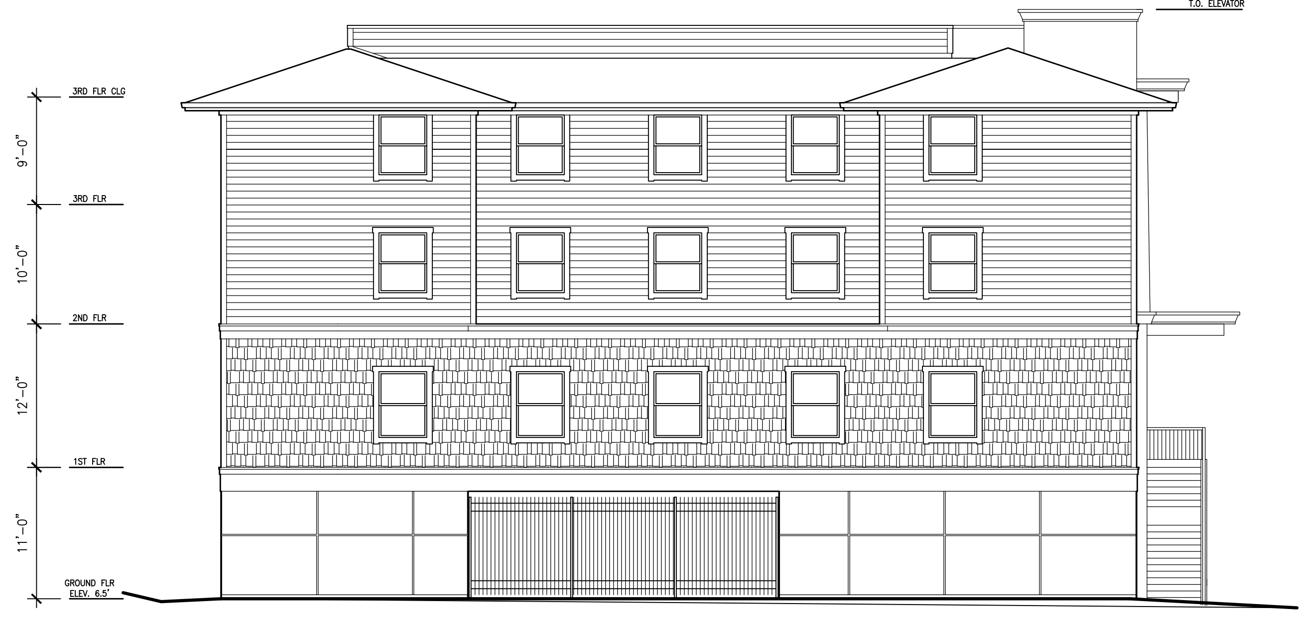
4 NORTH ELEVATION A3.0 SCALE: 1/8" = 1'-0"